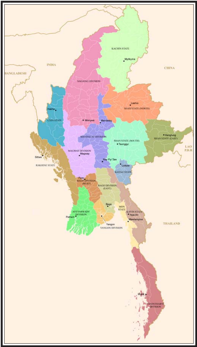
Figure 1: Map of the Republic of the Union of Myanmar